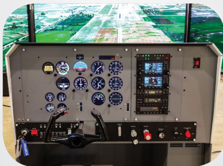
Analog cockpit configuration