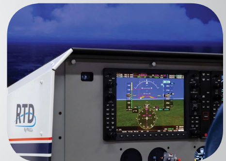
Real Garmin G1000 NXi Software

For more information about our product line, contact us today.